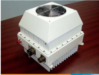
40 - 60W Ku-Band