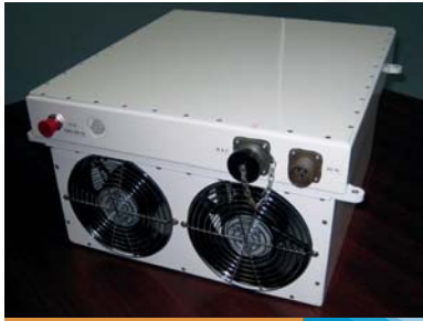
80 - 100W Ku-Band