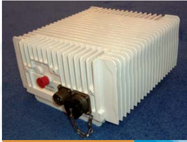
10 - 16W Ku-Band