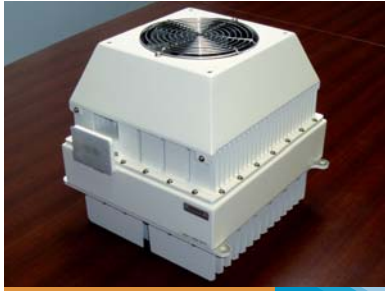
80 - 125W C-Band