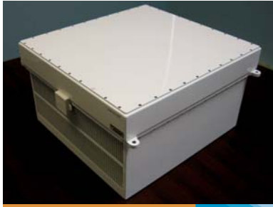
80 - 100W Ku-Band