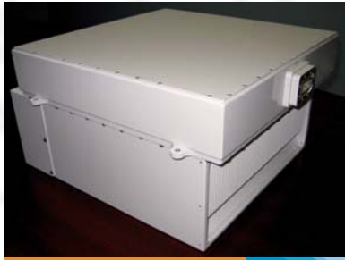
200 - 250W C-Band