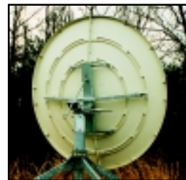
Back View 2.4M Rx/Tx

Prodelin Corporation is the world's largest manufacturer of Rx/Tx VSAT antennas. We have the broadest product line in the industry including Receive Only, Rx/Tx and Rural Telephony antenna systems. Prodelin offers nineteen antenna sizes, 47cm to 4.5M. Prodelin is the leader in obtaining type certifications and approvals for Intelsat, AsiaSat and Eutelsat. Prodelin antennas provide the best quality in the market due to the sophisticated, precision SMC compression molding process technology. Prodelin provides the best value antenna solution to the market with competitive prices, the highest quality products and superb engineering support. Prodelin is ISO registered, KEMA # 70022.01. Prodelin - The Market Leader in VSAT Antennas.