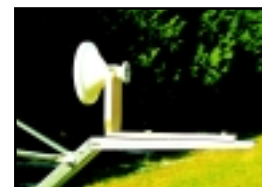
Option Ku-Band Feed